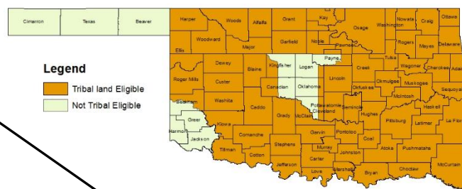
Tribal Eligibility for Affordable Connectivity Program (ACP)

Most OK Counties Qualify for $75 / month ACP Discount